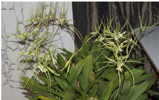
Grand Champion at our Ribbon Show. Brs verrucossa var gigantea .