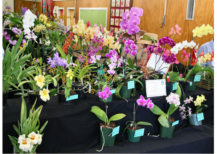
Just a small section of the Taraniaki Summer Show.