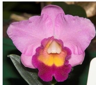
Pot CRB's Supreme